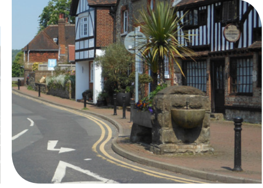
Victorian stone horse trough