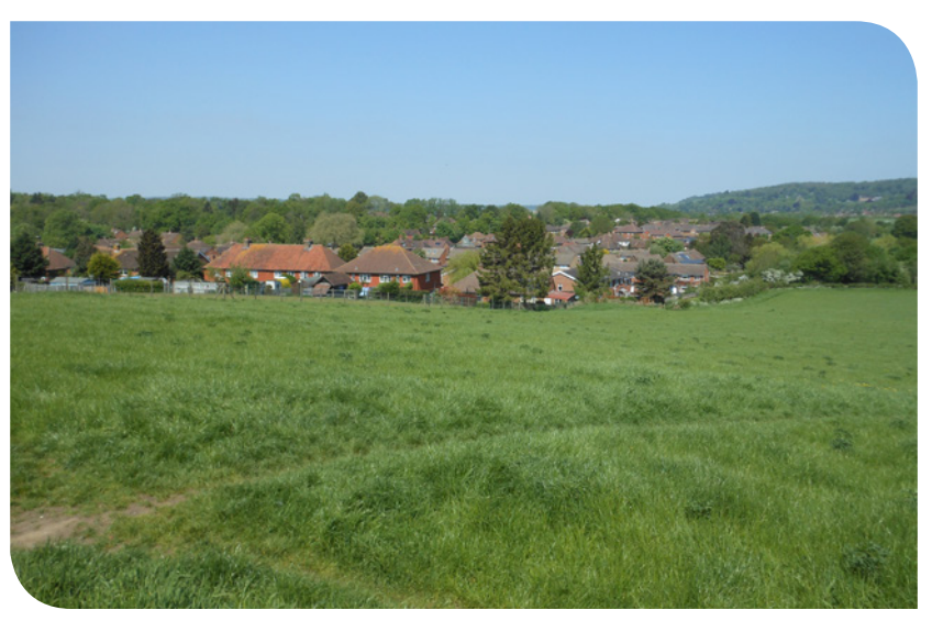
The buffer between the historic village and its the Seal Village Allotments, Jubilee Rise and Lulworth, School Lane extension