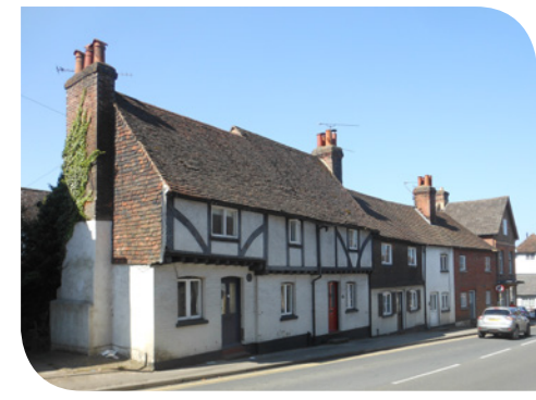
Two storeys with unbroken roof slopes