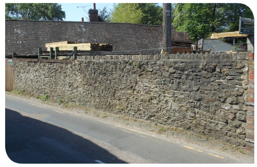
Inappropriate pointing to some ragstone walls