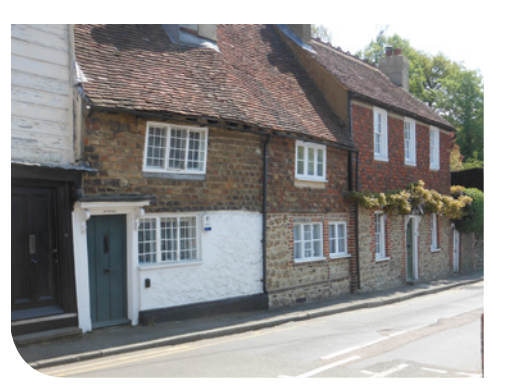
Small-scale and domestic