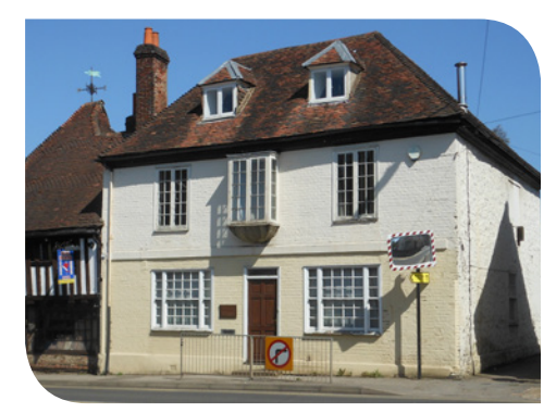
Sash windows and casement windows