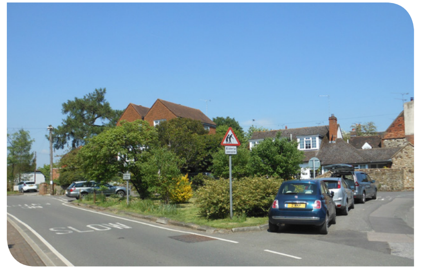
Part of the old village green