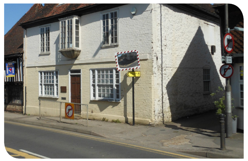
Traffic and other signage harming the setting of listed buildings on the High Street