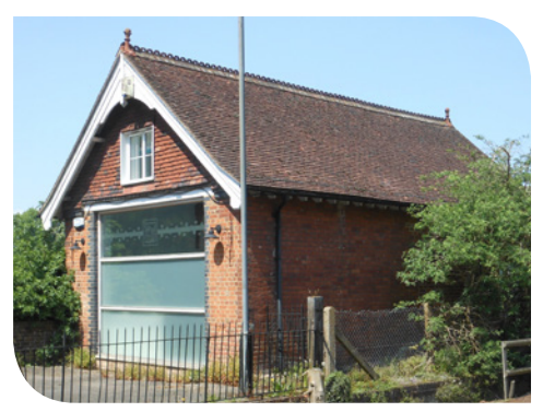
Clay tile roofs with decorative ridges