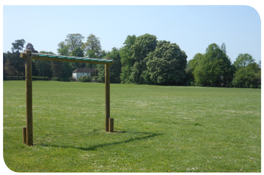
The Recreation Ground