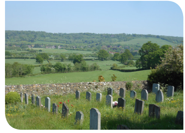
Contextual views which look out to the landscape beyond the conservation area and give an understanding of the topography and its setting (Views 2 and 6).