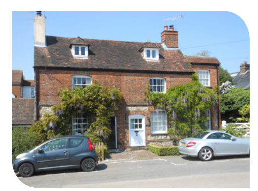
Local red brick