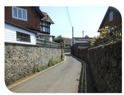
Kentish Ragstone walls

The Victorian stone horse trough at the junction of Church Street and High Street, a K6 telephone box outside the village hall and a Post Office pillar box outside the parade of shops on the High Street make positive contributions.