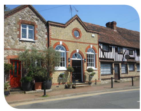
Kentish ragstone and yellow brick