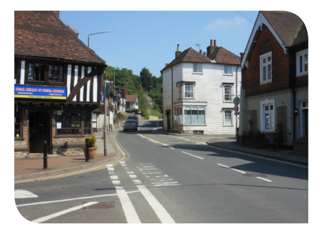
Townscape views within the conservation area which include a mix of building types and materials and give a sense of the spatial character and architectural quality of the village. (Views 1, 3–5, 7–9).

The important views are characterised by the interaction of informal groups of buildings of a strongly traditional character with the local topography. The only landmark building in the conservation area is the church, which can be seen quite widely, e.g. from the Recreation Ground and the Allotments, as well as in the views identified here.