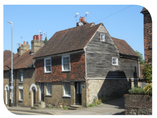
Tile-hanging and weatherboarding